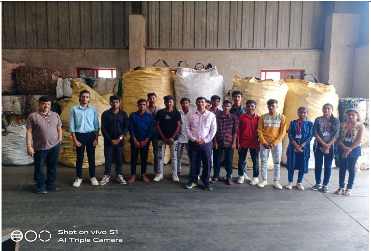
Some glimpses during industrial visit at Aero Fibre Pvt. Ltd; Silvassa -